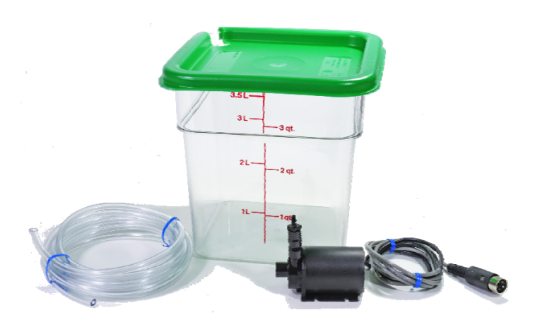
Figure 3. Submersible pump, bucket, electrical cable, and vinyl tubing for the Versa 20/E

1. Remove the existing sample compartment from the spectrophotometer. Install the Versa 20/E into the sample compartment and secure it in place.