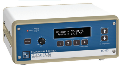
TC 425 Temperature Controller