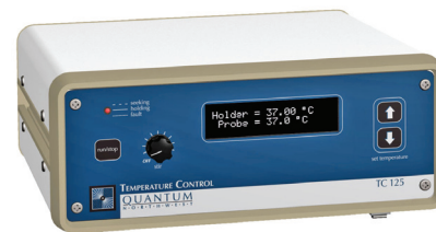
TC 125 Temperature Controller