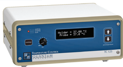
TC 125 Temperature Controller