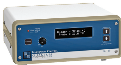
TC 125 Temperature Controller