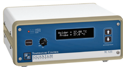
TC 125 Temperature Controller