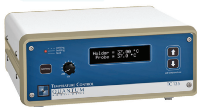
TC 125 Temperature Controller