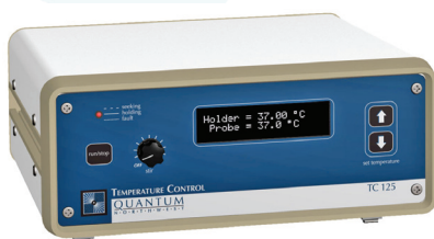
TC 125 Temperature Controller