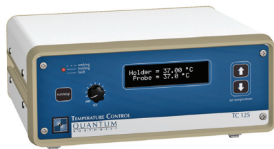
TC 125 Temperature Controller