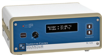
TC 125 Temperature Controller