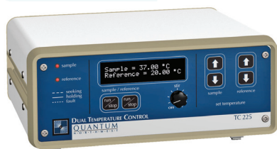
TC 225 Temperature Controller