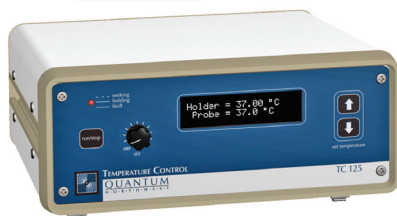
TC 125 Temperature Controller